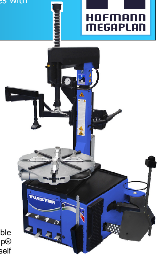
Shown with optional Spider Assist 2 press system

MADE IN EU Designed, and manufactured in ITALY 5 Patents pending®