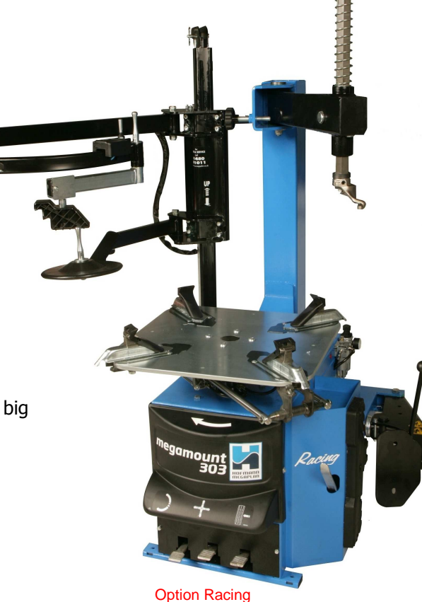
Two Clamping Cylinders For a powerful clamping also for the big tires.