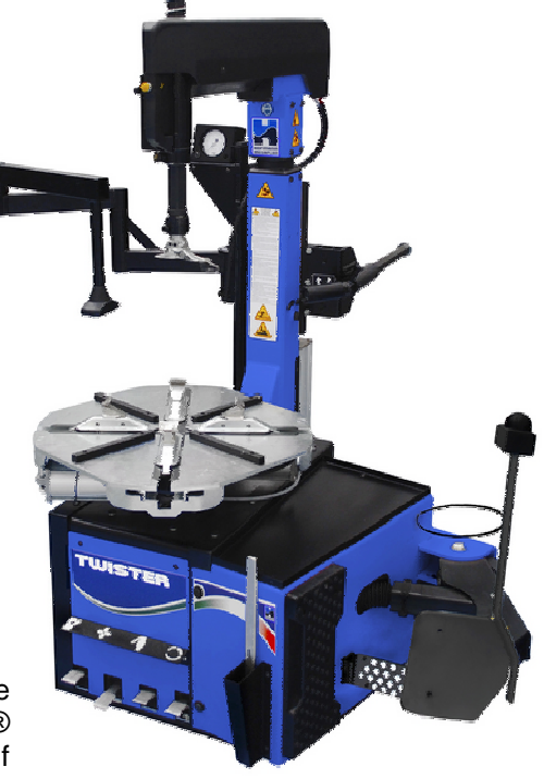
Shown with optional Spider Assist 2 press system

3 Years Warranty on the UniClamp® system.